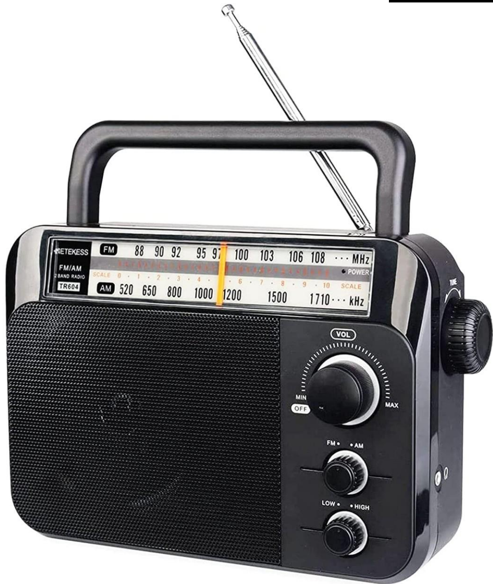
Umoja Radio For Peace